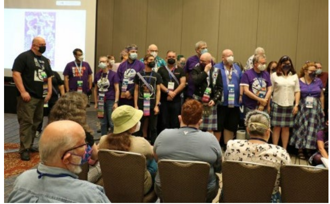
Some of the Glasgow 2024 Committee members in the "Tartan Landing Zone"